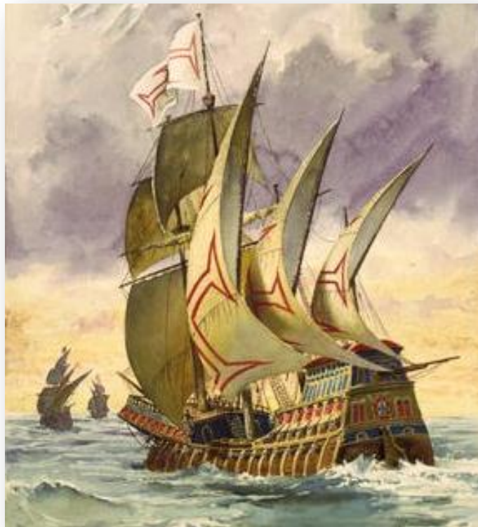
Portuguese Ships on the Atlantic Ocean